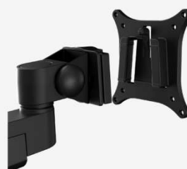
Quick Release Vesa