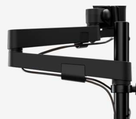
Segmented Cable Management