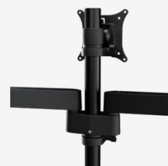
Universal Column Design